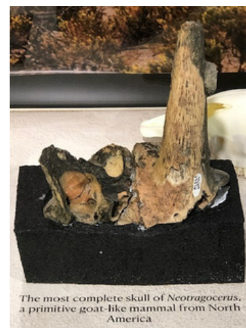
The most complete skull of Neotragocerus, a primitive goat-like mammal from North America