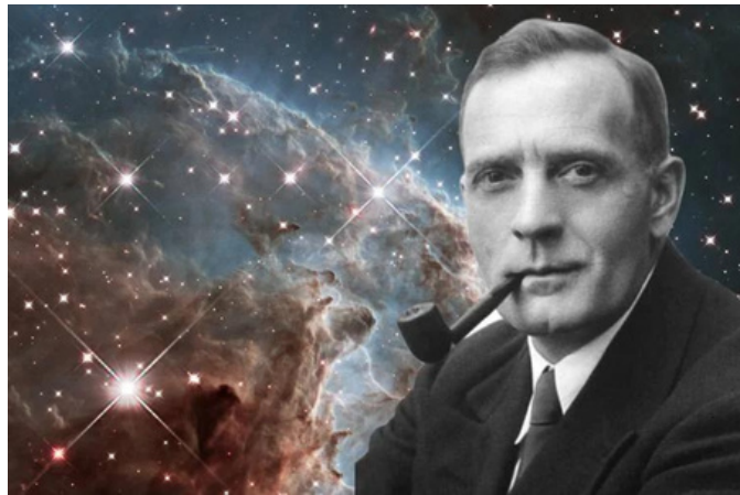
Edwin Hubble, an American Astronomer for whom the Hubble Telescope was named, played a crucial role in establishing the field of extragalactic astronomy and observational cosmology.

While Earth is not the center of the entire universe, it is the center of the Observable Universe, which is approximately 94 billion light years across. With the expansion of the universe accelerating, there are galaxies and other celestial bodies beyond the edge of the observable universe that we will never be able to see. Light can only travel so fast.